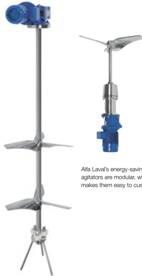
Alfa Laval's energy-saving agitators are modular, which makes them easy to customize.

As the leading mixing supplier, Alfa Laval offers a full spectrum of solutions for hygienic industries. Our portfolio includes energy-saving agitators, high-efficiency rotary jet mixers and ultra-clean magnetic mixers – as well as the pumps and heat exchangers needed for a complete solution.