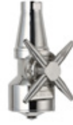
Rotary Jet Mixer