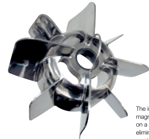
The impeller of Alfa Laval's magnetic mixers levitates on a magnetic field, which eliminates friction and maximizes cleanability.

Which technology is right for you depends on your application and goals. And since Alfa Laval offers all three technologies, we can assist you in finding the perfect match.