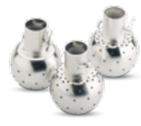
LKRK Static Spray Ball