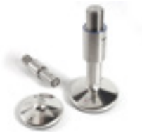
Machine Feet and Tank Feet