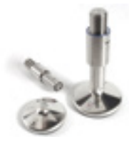
Machine Feet and Tank Feet