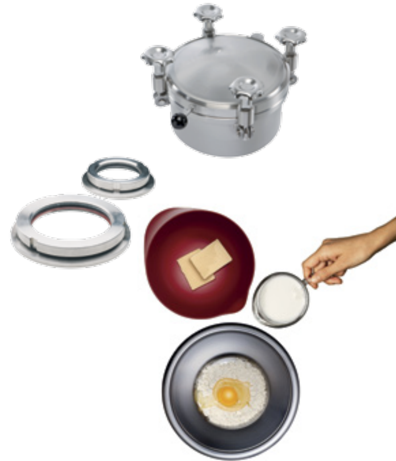
Alfa Laval can provide all the accessories to make your tank complete, including tank covers, machine feet, tank feet and sight glasses.

With Alfa Laval service you maximize the reliability and uptime of your equipment. The result is superior performance throughout the equipment life cycle – performance that puts you ahead of competition.