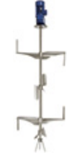
Agitator ALTB Ensafem