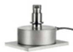
Weighing System UltraPure