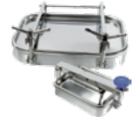
Access Tank Cover C-O-R