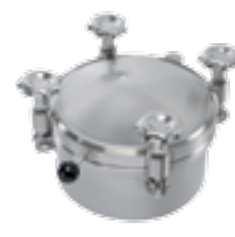
Pressure Cover HLSD-2