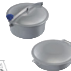
LKDC and LKDS