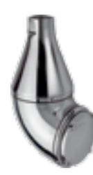
Toftejorg SaniJet 25