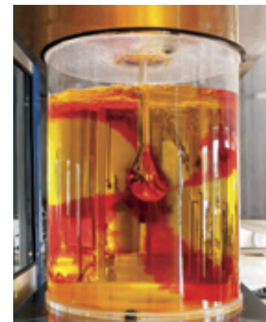
Alfa Laval's Rotary Jet Mixer injects fluid, gas or powder through rotating jet nozzles – without causing the liquid to rotate.