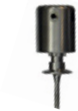
Potentiometric Level Transmitter