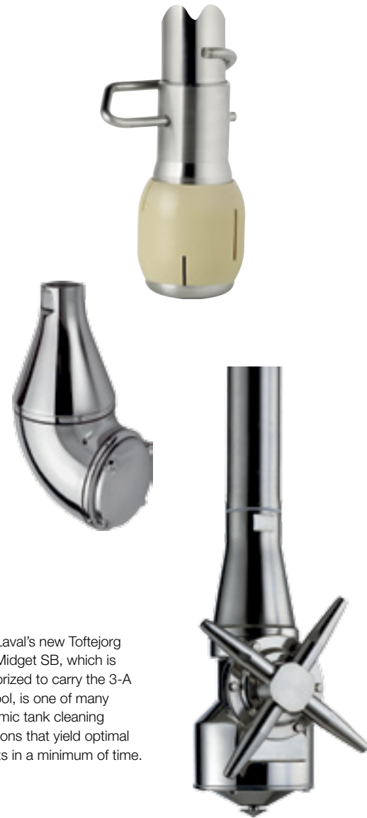
Alfa Laval's new Toftejorg SaniMidget SB, which is authorized to carry the 3-A symbol, is one of many dynamic tank cleaning solutions that yield optimal results in a minimum of time.

What happens in each mixing cycle is influenced by what happens in between. Effective cleaning not only ensures high productivity, it also helps maintain the integrity of your product.