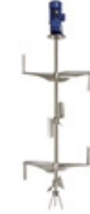
Agitator ALTB Ensafem