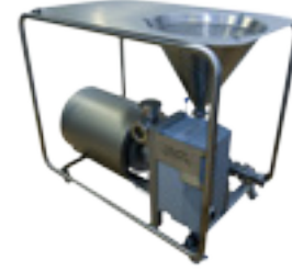
Hybrid Powder Mixer