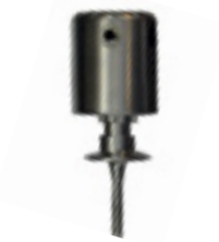
Potentiometric Level Transmitter