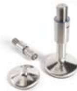
Machine feet and tank feet