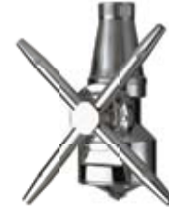
Iso-Mix rotary jet mixer