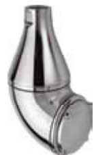
Toftejorg SaniJet 25