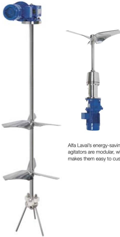
Alfa Laval's energy-saving agitators are modular, which makes them easy to customize.

Our Iso-Mix rotary jet mixers create savings in other ways. Driven by pump, they inject fluid, gas or powder through rotating nozzles beneath the liquid surface. No baffles are required, and the mixing heads double as tank cleaning equipment at the end of the mixing cycle. But most importantly, the high-intensity of the mixing translates into rapid payback. Breweries, for example, have used rotary jet mixers to shorten fermentation time by 30%.