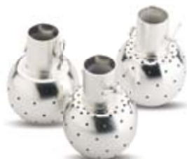
LKRK Static spray ball