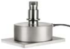
Weighing system UltraPure