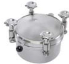
Pressure cover HLSD-2