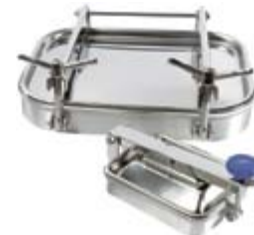
Access tank cover C-O-R